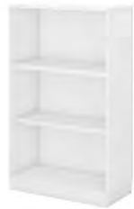
OPEN SHELF MEDIUM CABINET Q-YO 13 800W x 400D x 1310H