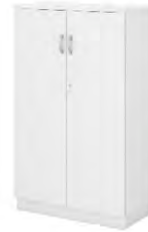
SWINGING DOOR MEDIUM CABINET Q-YD 13 800W x 400D x 1310H