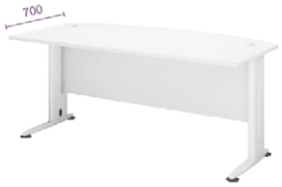
EXECUTIVE TABLE HMB 180A 1800W x 900D x 750H