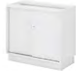
SLIDING DOOR LOW CABINET (w/o Top) Q-YS 872 796W x 430D x 725H Q-YS 972 896W x 430D x 725H