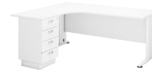
SUPERIOR COMPACT TABLE (L) HL 1515-4D 1500W x 700 x 1500 x 600D x 750H HL 1815-4D 1800W x 700 x 1500 x 600D x 750H