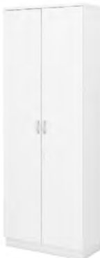
SWINGING DOOR HIGH CABINET Q-YD 21 800W x 400D x 2110H