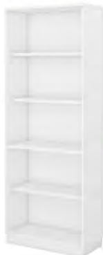
OPEN SHELF HIGH CABINET Q-YO 21 800W x 400D x 2110H