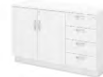
SWINGING DOOR + FIXED PEDESTAL 4D Q-YDP 7124 1200W x 450D x 750H