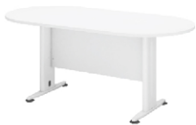
OVAL CONFERENCE TABLE HOE 18 1800W x 900D x 750H HOE 24 2400W x 1200D x 750H