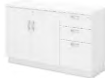
SWINGING DOOR + FIXED PEDESTAL 2D1F Q-YDP 7123 1200W x 450D x 750H