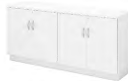
DUAL SWINGING DOOR LOW CABINET Q-YDD 7160 1600W x 450D x 750H Q-YDD 7180 1800W x 450D x 750H