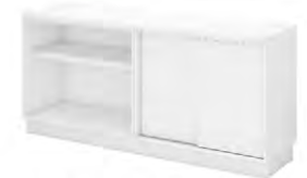
OPEN SHELF + SLIDING DOOR LOW CABINET Q-YOS 7160 1600W x 450D x 750H Q-YOS 7180 1800W x 450D x 750H