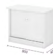
SLIDING DOOR SIDE CABINET Q-YS 303 900W x 450D x 700H