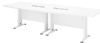
BOAT-SHAPE CONFERENCE TABLE (included YBV 20 2 Units) HBB 30 3000W x 1200/900D x 750H