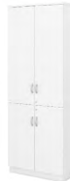
DUAL SWINGING DOOR HIGH CABINET Q-YTD 21 800W x 400D x 2110H