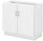
SWINGING DOOR LOW CABINET (w/o Top) Q-YD 872 796W x 446D x 725H Q-YD 972 896W x 446D x 725H