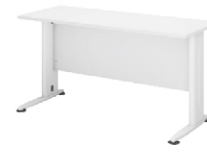
STANDARD TABLE (w/o Grommet) HT 126 1200W x 600D x 750H HT 156 1500W x 600D x 750H