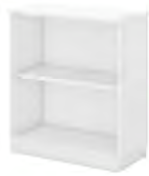
OPEN SHELF LOW CABINET Q-YO 9 800W x 400D x 910H