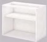
OPEN SHELF LOW CABINET (w/o Top & Base) YO 863 796W x 430D x 630H YO 963 896W x 430D x 630H