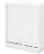
SLIDING DOOR LOW CABINET Q-YS 9 800W x 400D x 910H