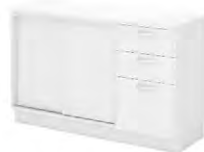
SLIDING DOOR + FIXED PEDESTAL 2D1F Q-YSP 7123 1200W x 450D x 750H