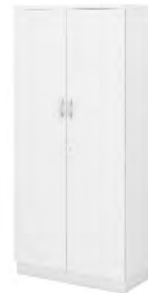
SWINGING DOOR MEDIUM CABINET Q-YD 17 800W x 400D x 1710H