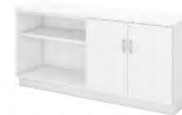
OPEN SHELF + SWINGING DOOR LOW CABINET Q-YOD 7160 1600W x 450D x 750H Q-YOD 7180 1800W x 450D x 750H