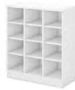
PIGEON HOLE LOW CABINET Q-YP 9 800W x 400D x 910H