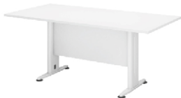
RECTANGULAR CONFERENCE TABLE HVE 18 1800W x 900D x 750H HVE 24 2400W x 1200D x 750H