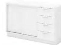
SLIDING DOOR + FIXED PEDESTAL 4D Q-YSP 7124 1200W x 450D x 750H