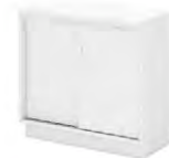
SLIDING DOOR LOW CABINET Q-YS 875 800W x 450D x 750H Q-YS 975 900W x 450D x 750H