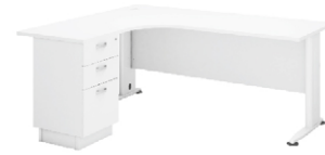
SUPERIOR COMPACT TABLE (L) HL 1515-3D 1500W x 700 x 1500 x 600D x 750H HL 1815-3D 1800W x 700 x 1500 x 600D x 750H