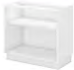
OPEN SHELF LOW CABINET (w/o Top) YO 872 796W x 430D x 725H YO 972 896W x 430D x 725H