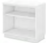
OPEN SHELF LOW CABINET Q-YO 875 800W x 450D x 750H Q-YO 975 900W x 450D x 750H