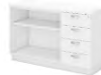
OPEN SHELF + FIXED PEDESTAL 4D Q-YOP 7124 1200W x 450D x 750H