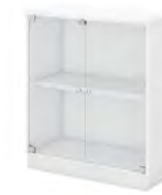
SWINGING GLASS DOOR LOW CABINET Q-YG 9 800W x 400D x 910H