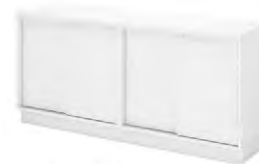
DUAL SLIDING DOOR LOW CABINET Q-YSS 7160 1600W x 450D x 750H Q-YSS 7180 1800W x 450D x 750H