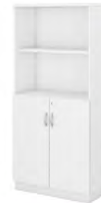
SEMI SWINGING DOOR MEDIUM CABINET Q-YOD 17 800W x 400D x 1710H