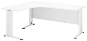
SUPERIOR COMPACT TABLE (L) HL 1515 1500W x 700 x 1500 x 600D x 750H HL 1815 1800W x 700 x 1500 x 600D x 750H