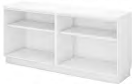
DUAL OPEN SHELF LOW CABINET Q-YOO 7160 1600W x 450D x 750H Q-YOO 7180 1800W x 450D x 750H