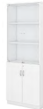
SWINGING GLASS DOOR HIGH CABINET Q-YGD 21 800W x 400D x 2110H