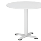
ROUND CONFERENCE TABLE HR 90 900W x 900D x 750H HR 120 1200W x 1200D x 750H