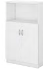
SEMI SWINGING DOOR MEDIUM CABINET Q-YOD 13 800W x 400D x 1310H