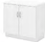
SWINGING DOOR LOW CABINET Q-YD 875 800W x 450D x 750H Q-YD 975 900W x 450D x 750H