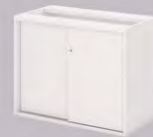
SLIDING DOOR LOW CABINET (w/o Top & Base) Q-YS 863 796W x 430D x 630H Q-YS 963 896W x 430D x 630H