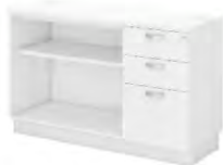
OPEN SHELF + FIXED PEDESTAL 2D1F Q-YOP 7123 1200W x 450D x 750H