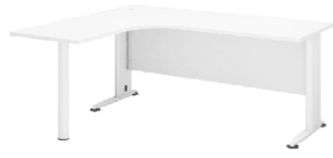
SUPERIOR COMPACT TABLE (L) HL 1515-M 1500W x 700 x 1500 x 600D x 750H HL 1815-M 1800W x 700 x 1500 x 600D x 750H