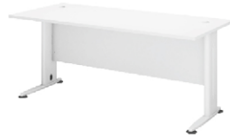
STANDARD TABLE HT 128 1200W x 800D x 750H HT 158 1500W x 800D x 750H HT 188 1800W x 800D x 750H