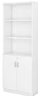
SEMI SWINGING DOOR HIGH CABINET Q-YOD 21 800W x 400D x 2110H