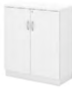
SWINGING DOOR LOW CABINET Q-YD 9 800W x 400D x 910H